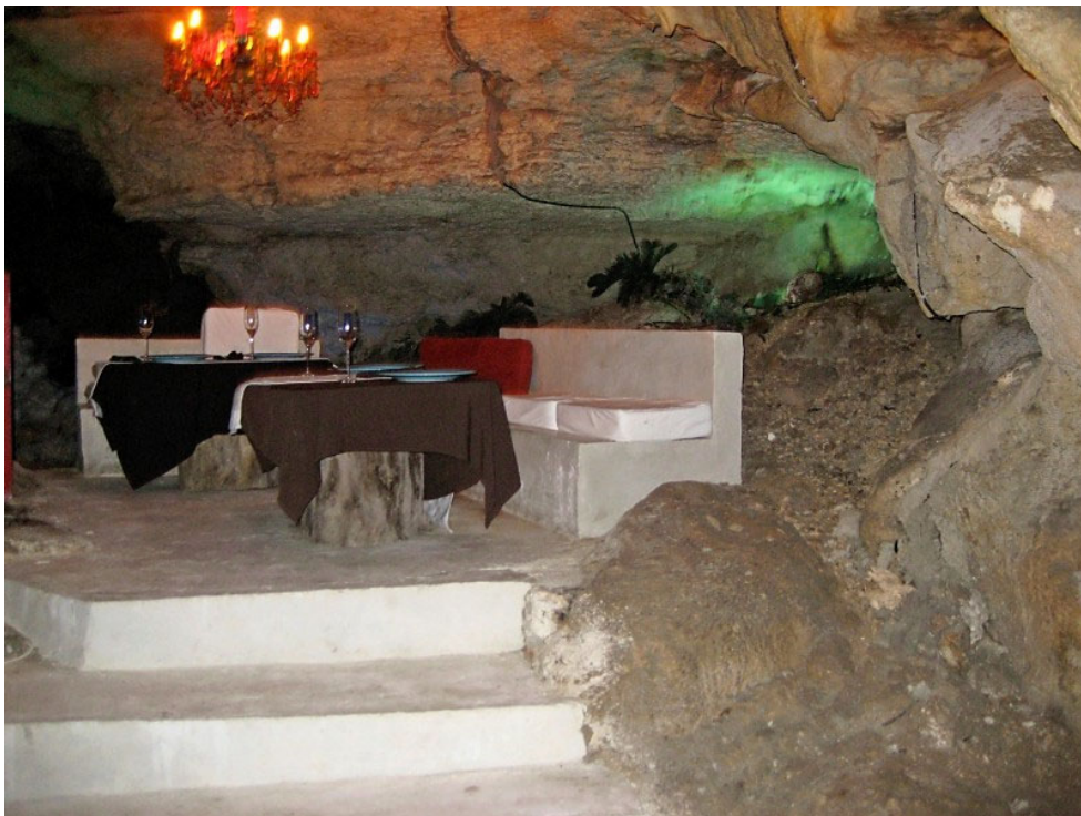
Dining in an underground cavern is a must-do Playa experience

*Important note: The environment around Playa is constantly changing. Please keep this in mind, as occasionally this list may change without us being aware of it. These are suggestions only!